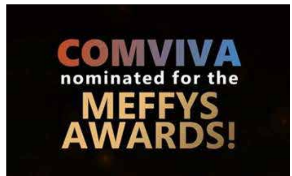
MEFFY's Award 2025 Nominee (Best Anti-Fraud Solution)