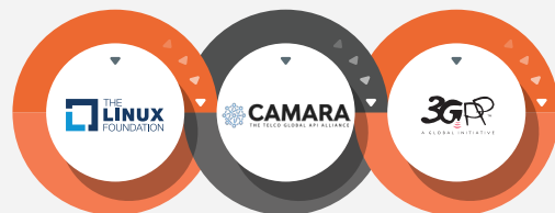
Industry Standards and Ecosystem