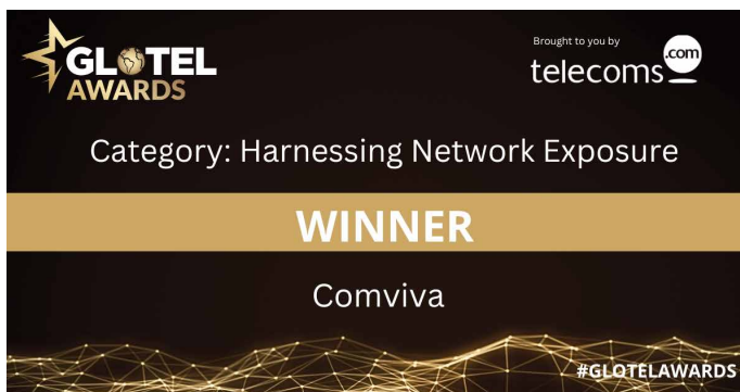
Winner - GLOTEL AWARDS 2024 (Harnessing Network Exposure)