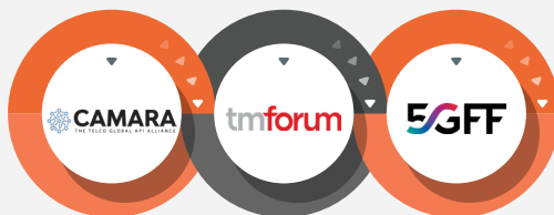
Alliances and Association